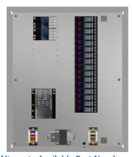
Alternate Available Part Numbers: NXL-R16i & NXL-R16a