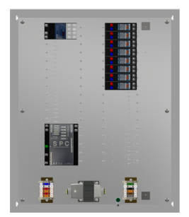
Alternate Available Part Numbers: NXL-R8i & NXL-R8a